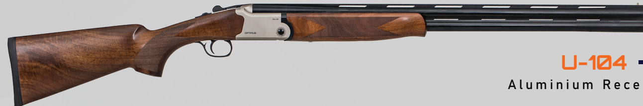
U-104 Aluminium Receiver