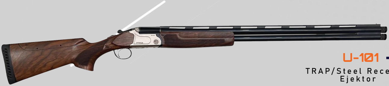
U-101 TRAP/Steel Receiver Ejektor