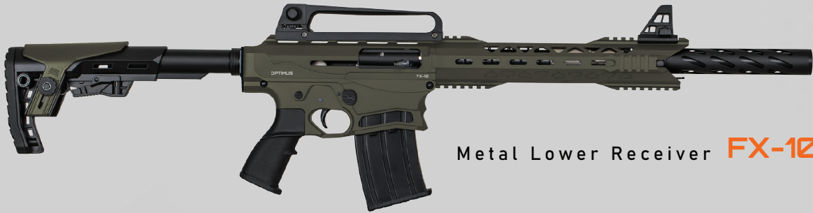
Metal Lower Receiver FX-102