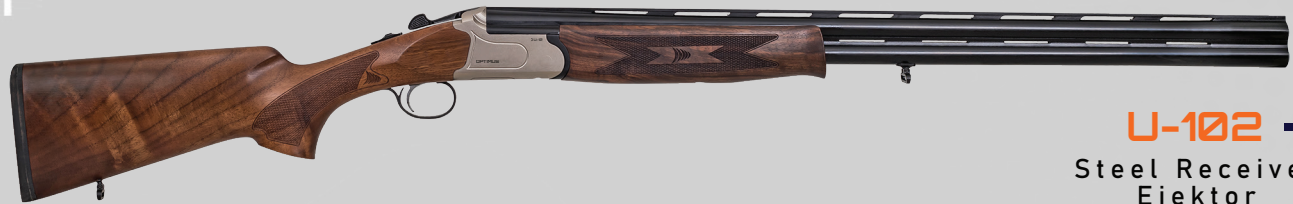
U-102 Steel Receiver Ejektor