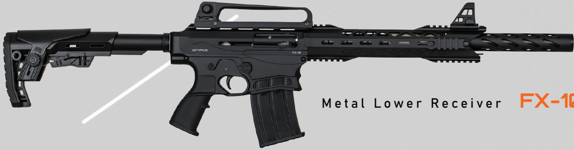
Metal Lower Receiver FX-101